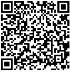
QR Code for App & Connect Handheld